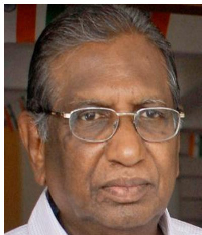
Prof. Kothapally JAYASHANKAR, The ideologue of Telangana, Indian Academic & Social Activist (1934-2011)